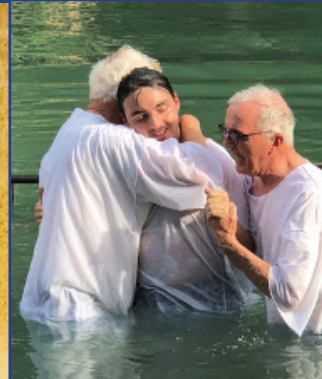
BAPTISM AT THE JORDAN RIVER