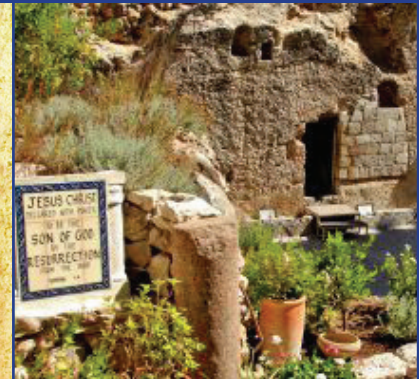
THE GARDEN TOMB OF JESUS CHRIST