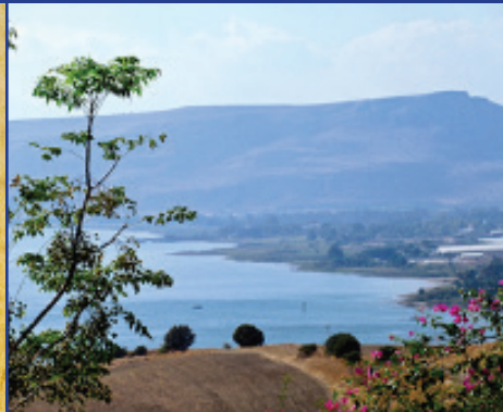
MOUNT OF BEATITUDES OVERLOOKING THE SEA OF GALILEE