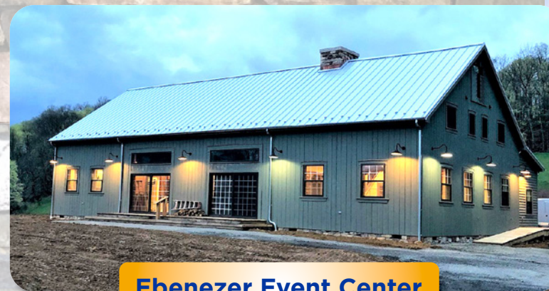
Ebenezer Event Center