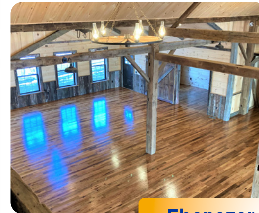
Ebenezer Event Center